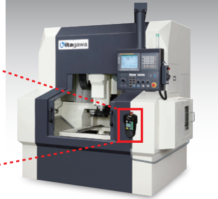
Strong magnet sticks pendant switch anywhere.